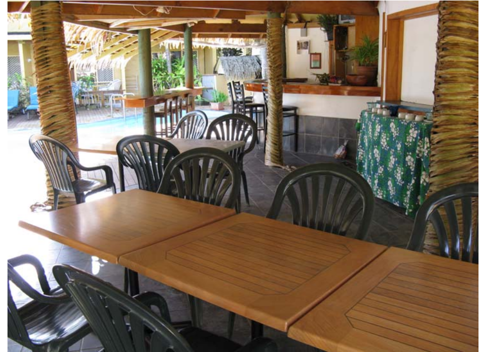
Castaway Beachfront Villas 2008