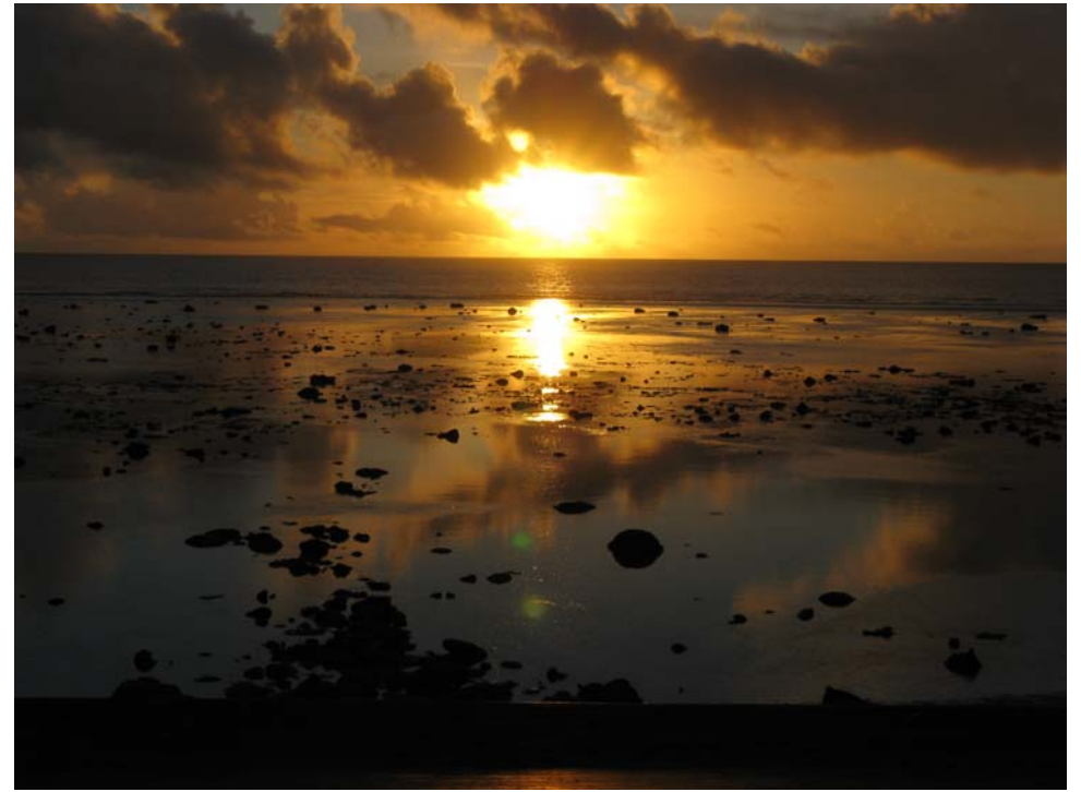
View from our bungalow