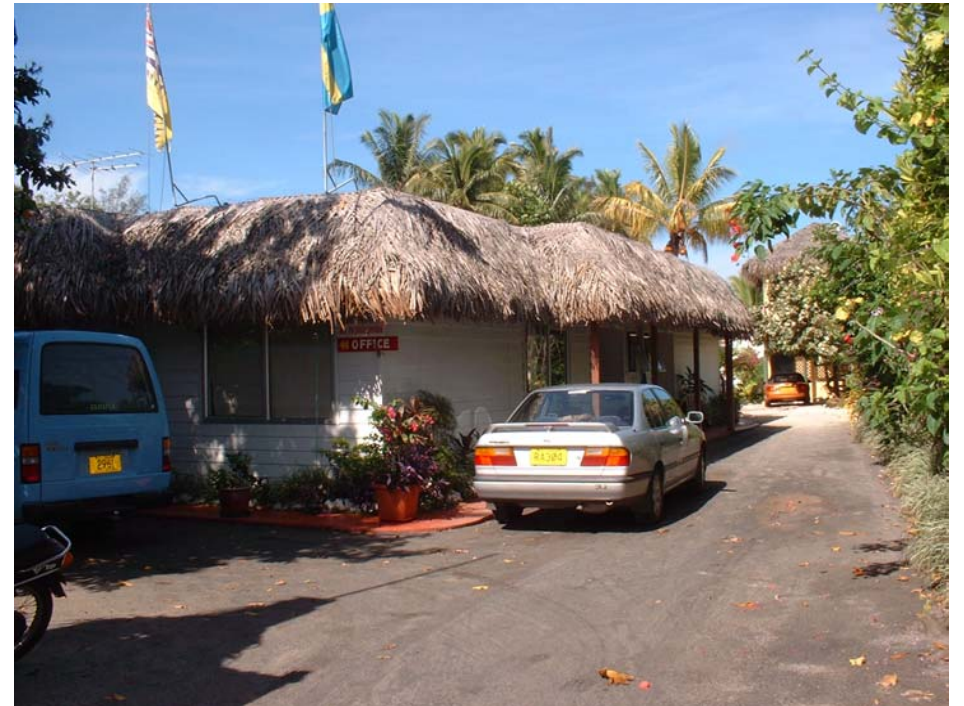
Castaway Beachfront Villas