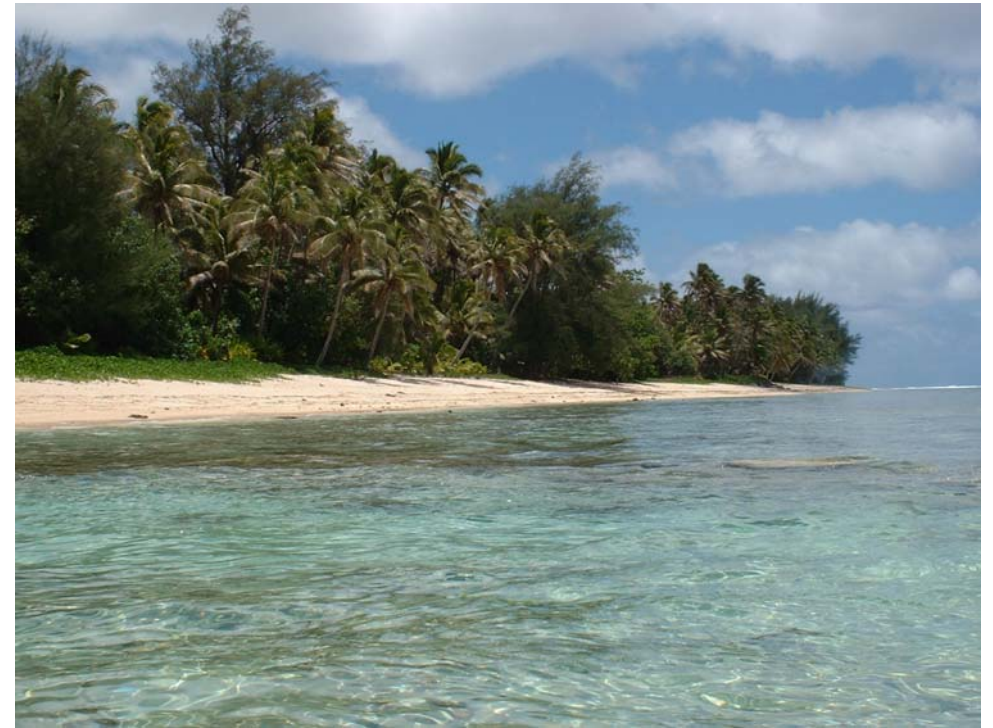
Area around Castaway