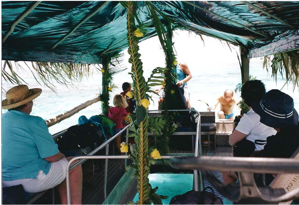
A glass bottom boat