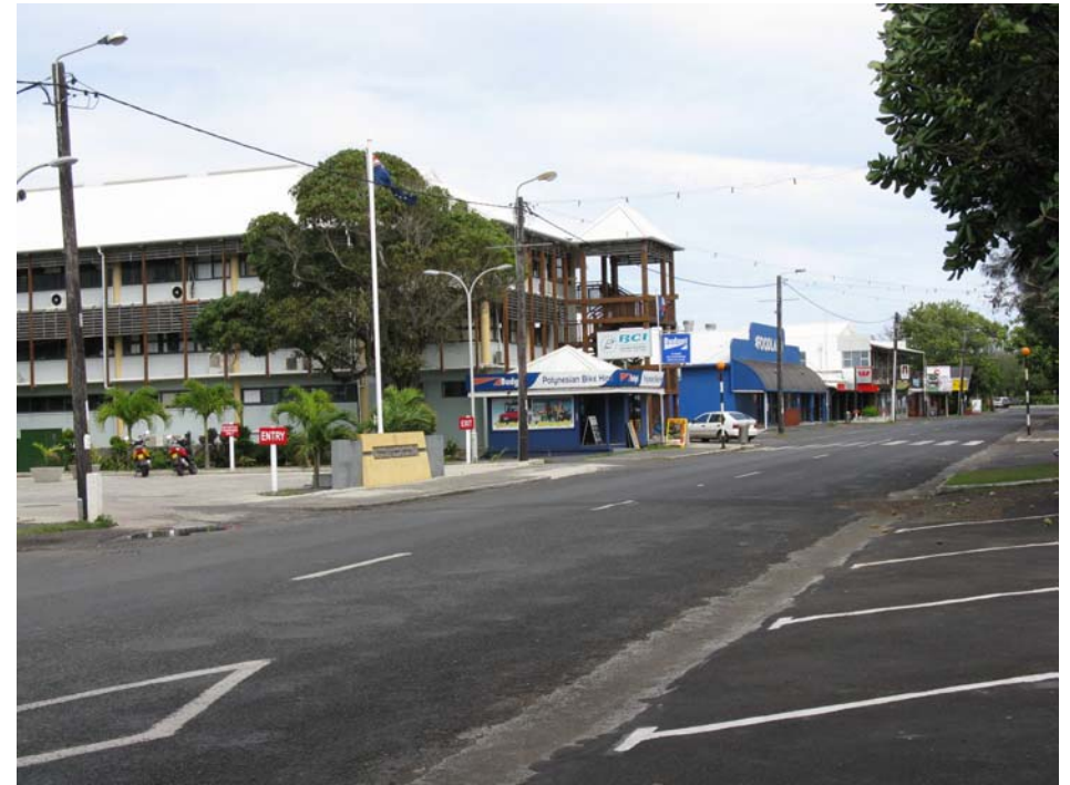
Avarua, the capitol of Rarotonga