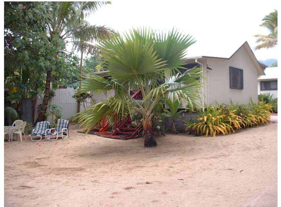
Our Bungalow with an oceanview