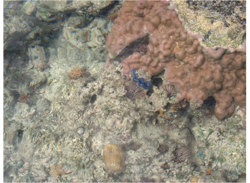
Beautiful Coral and Sealife