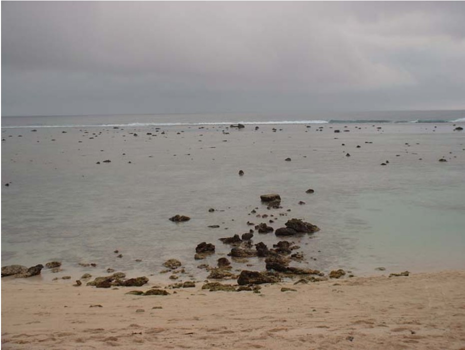
At low tide you can walk out to the edge of the reef