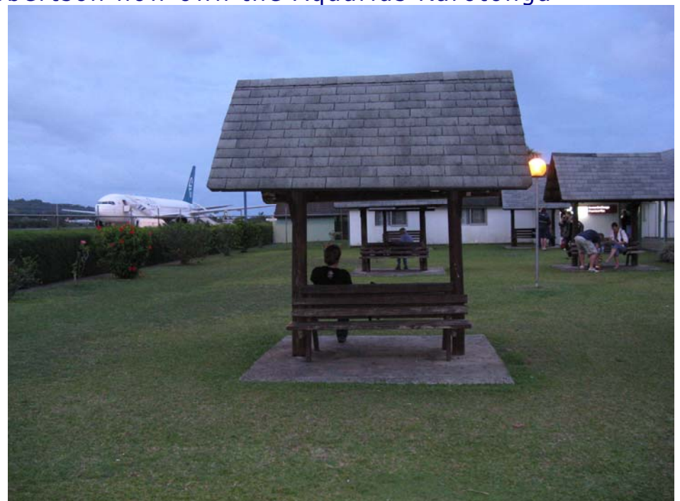
Rarotonga Airport departure waiting area