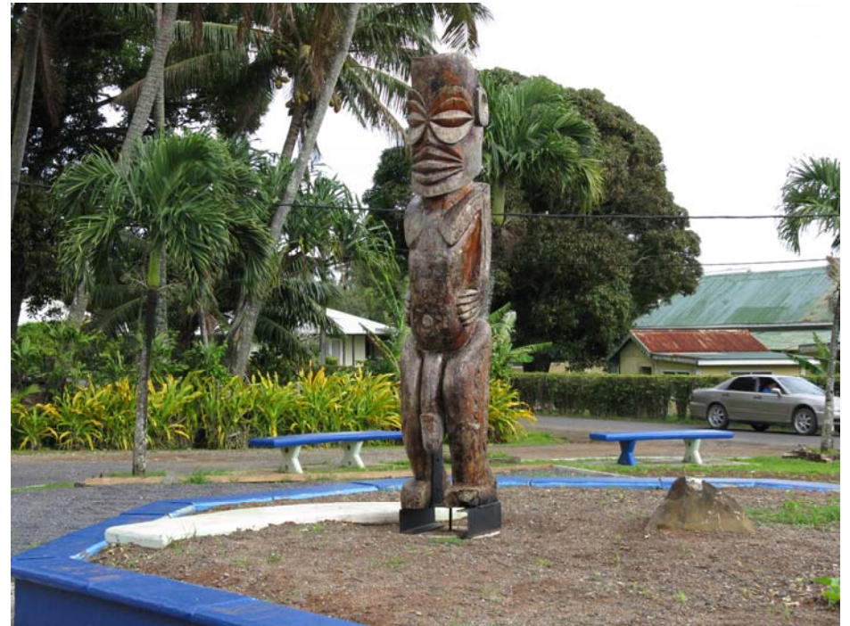
Tangaroa Statue at The Perfume Factory, Avarua Marae Arai-te-tonga, Rarotonga's most sacred cult site