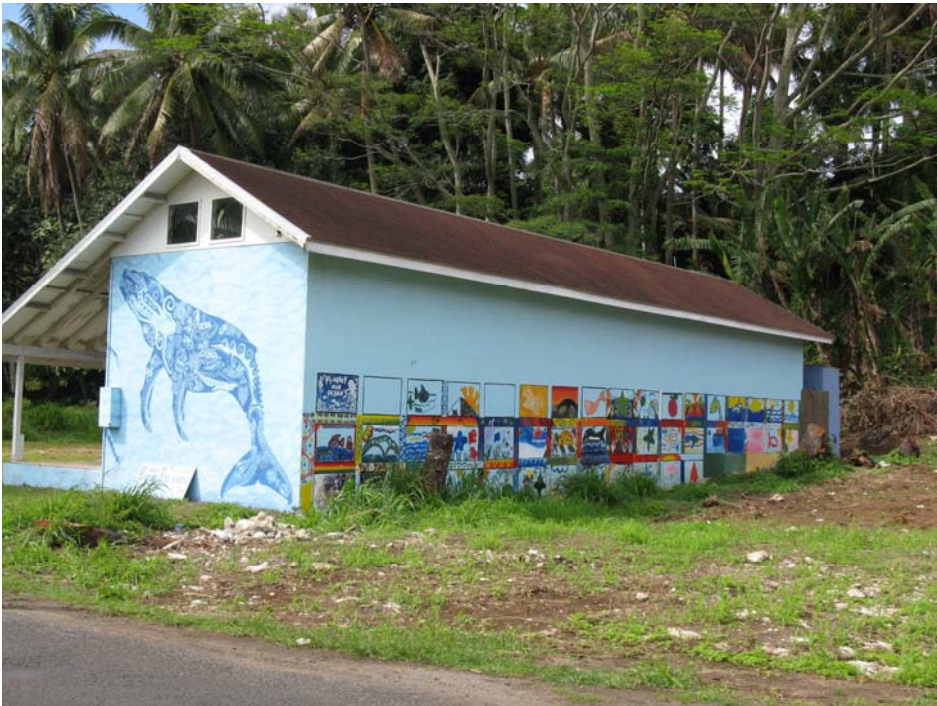
The Whale museum